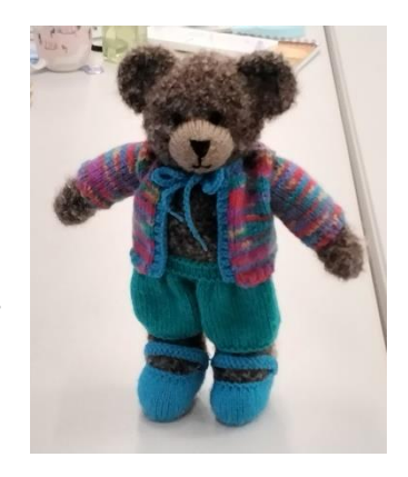
NRCHI Newsletter September 2023

A warm and friendly way to start a Wednesday.